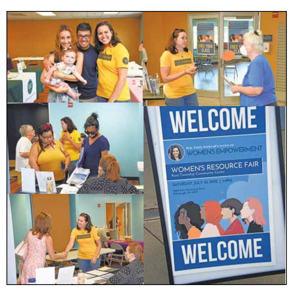
Our inaugural Women's Resource Fair at the Ross Community Center.