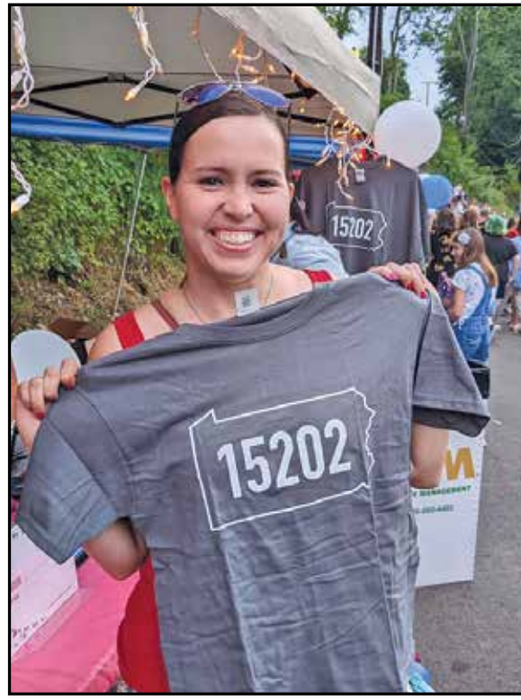
Checking out some vendors at the North Boroughs Community Day.