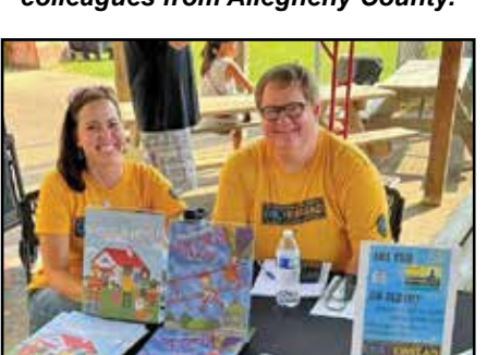
Helping folks access state resources at Ross Township's Community Day (Ward 5) in Scharmyn Park.