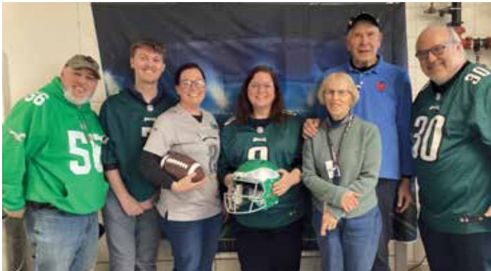
Our team had a wonderful time serving with PA Wounded Warriors at the Southeastern Veterans' Center for the Eagles celebration.