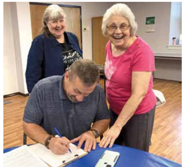
I recently joined the Phoenixville Area Seniors Center, which apparently was cause for some smiles.