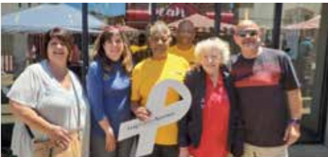
Enjoying Bridgeville's community day!