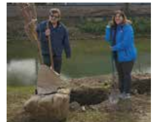
Tree planting in Carnegie.