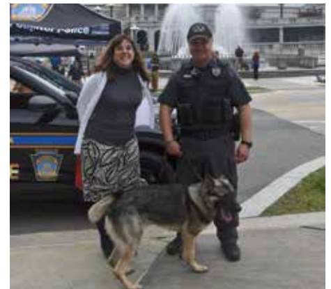
Recognizing working dogs from police and rescue units – as well as their human partners!