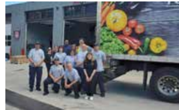
Thanks to the East Carnegie Fire Department for hosting a food pantry event in the spring and for all of their hard work, every day!