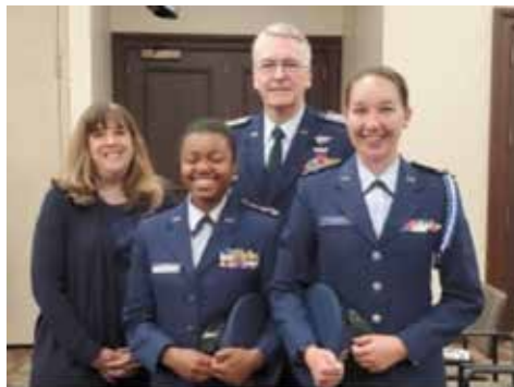
Members of Civil Air Patrol gave an update on their efforts during a joint meeting of the House and Senate Veterans Affairs and Emergency Preparedness committees.