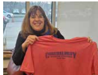
A good day at Chartiers Valley High School.