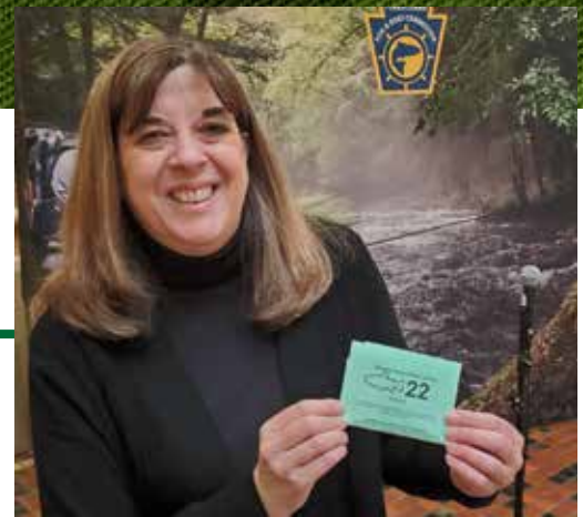
Getting a fishing license at the Capitol.

Mark your calendars! Pennsylvania has three Sunday hunting dates for 2022. Learn more about what game can be hunted on each Sunday, requirements on what hunters should wear and other useful information in the Hunting & Trapping digest, which is available here: https://www.pgc.pa.gov/HuntTrap/Law/Pages/HuntingandTrappingDigest.aspx .