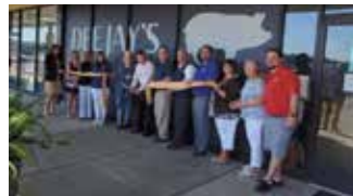
Celebrating the opening of DeeJay's BBQ in Collier Township.