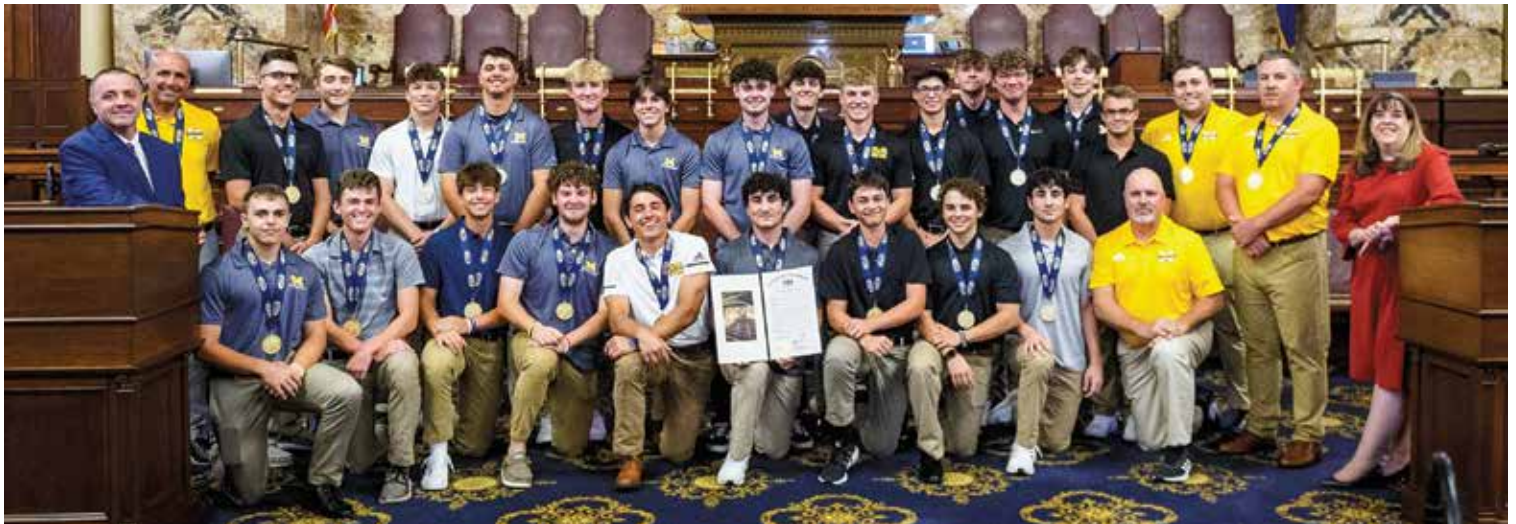
It was great having the 2022 PIAA 4A baseball state champions, the Montour Spartans, honored at the state Capitol in June. Congratulations!