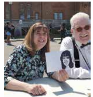
Celebrating at the Carnegie Library.