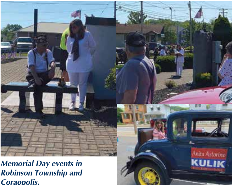
Memorial Day events in Robinson Township and Coraopolis.