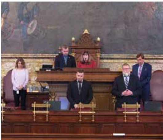
Offering the opening prayer before Session in May.