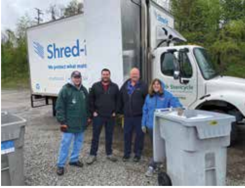
Spring Shred Event.