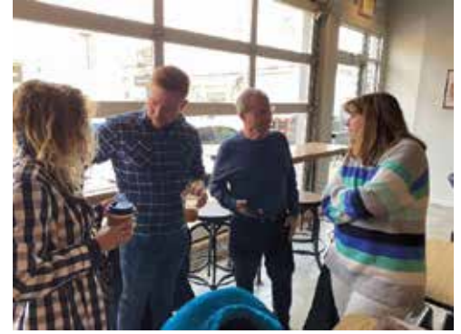
Meet Your Public Officials Event in Coraopolis.