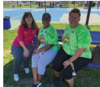
It was a beautiful day for the Cory Jam community event.