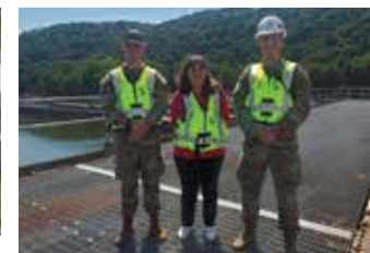
Visiting with members of the Army Corps of Engineers at the Montgomery Locks and Dam.