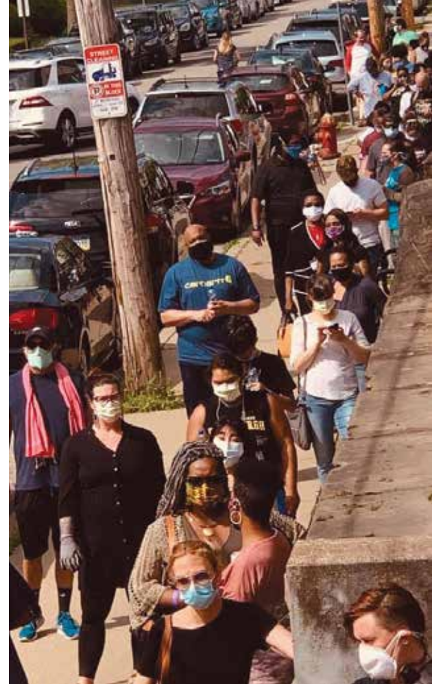
Voters wait to vote at a Pittsburgh-area polling station in June.