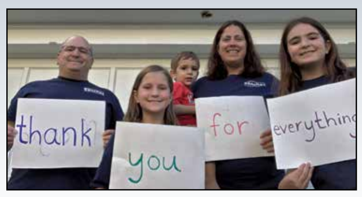
My family thanks the countless heroes out there who've risen to the occasion to make a positive difference during these unprecedented times.

One of the best parts of living here is getting to know all the thoughtful, kind-hearted residents of the 153rd Legislative District who want to help, and there are many wonderful community organizations that need our help now more than ever. My office usually organizes multiple donation drives throughout the year, benefiting community organizations like the ones shown to the right. While these are just two of the organizations our office has supported, please, if you know of others, lift them up as well. Share information about them on your social media accounts, help them and continue to be the generous and wonderful community that we all need during this uncertain and unprecedented time. I am hopeful that our regular drives will be up and running again soon.