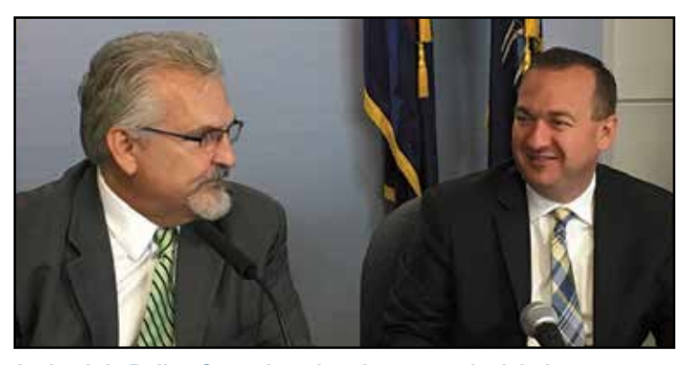
At the July Policy Committee hearing on my legislation.

The House Democratic Policy Committee was at the Lehigh County Government Center in late July for a public hearing on my legislation. It is my hope that my colleagues in Harrisburg will support this very important legislation, in an effort to protect the health and well-being of all Pennsylvanians.