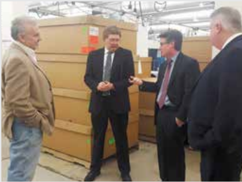
Rep. Sturla recently toured VisionCorps in Lancaster. VisionCorps serves blind and visually impaired individuals through rehabilitation and employment opportunities.