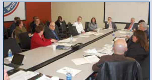
The policy committee hears from business leaders in Allentown to discuss Pennsylvania's economy.