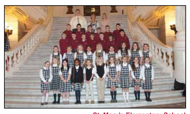
St. Mary's Elementary School