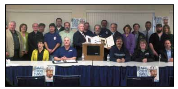
Rep. Pashinski takes part in the Greater Wilkes-Barre Labor Council's Workers' Memorial Day celebration.

My resolution also specifically recognizes the Greater Wilkes-Barre Labor Council for its observance and support in honoring workers in Pennsylvania and across the nation. Workers' Memorial Day serves as a reminder to strive for the appropriate oversight and to take every step necessary to ensure safe, hazard-free workplaces.