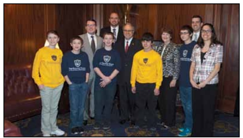
Scranton School for the Deaf