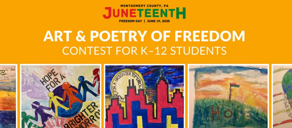
DEADLINE: FRIDAY, MAY 16