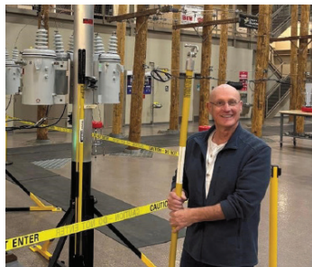
Visiting IBEW 126! Always great to visit a union hall and meet with hardworking individuals.