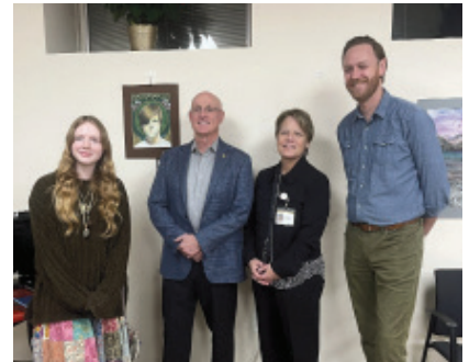
I showcased some of the beautiful art from Perkiomen Valley High School students in my district office this winter!