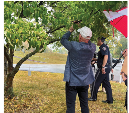
In September I held a Witting Tree dedication in honor of Veterans Suicide Prevention Week.