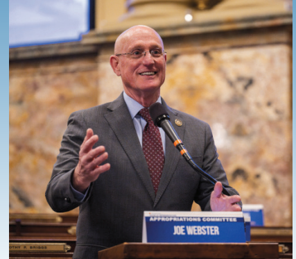
In February I attended numerous weeks of budget hearings in the Pennsylvania House of Representatives.