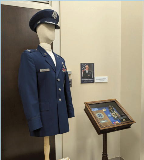
If you take a trip to our beautiful State Capitol, make sure you tour the Pennsylvania House archives and check out my exhibit! I gladly donated my uniform and other pieces from my time in the service as part of an exhibit that honors state representatives who have served.

These priorities are a snapshot of the many items contained in Pennsylvania’s proposed budget. We continue to work for a Commonwealth that is safe, forward-thinking and working for each and every Pennsylvanian.