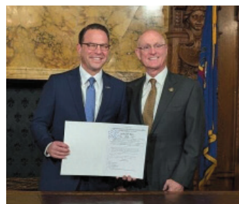
With Gov. Shapiro as he signed my Veterans' Records of Discharge bill into law.