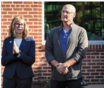
I attended the opening of Mitzvah Circle's new location in Lansdale, PA!

Requires massage businesses to have a valid facility license, manager's license, and table shower license to prevent human trafficking.