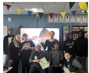
I had a great time reading at The Pathway School for Literacy Celebration Week.