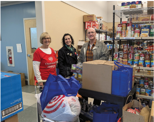
I am always pleased to support local nonprofits like St. James Outreach with a Winter Collection Drive. Thank you to all who help those in our community that most need it. Keep an eye out for announcements regarding my annual Summer Collection Drive!

Appropriations | Environmental & Natural Resource Protection | Finance Veterans Affairs & Emergency Preparedness | State Government