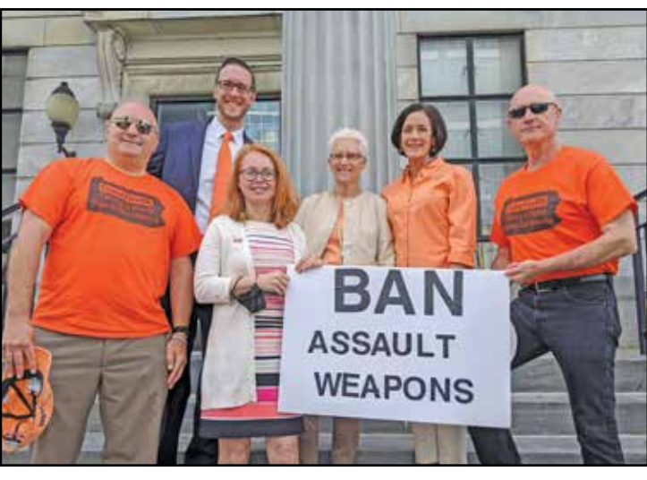
Standing with nonpartisan group CeaseFire PA and state and county officials on the county steps to call for gun reform.