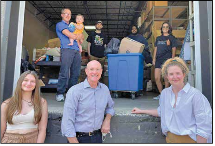
Dropping off donations from my collection drive at Mitzvah Circle with staff!