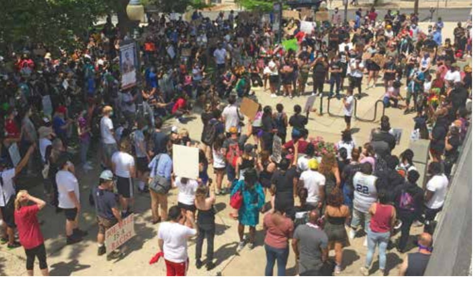
Protestors rallied in Norristown in support of Black Lives Matter and creating substantive change for our community.