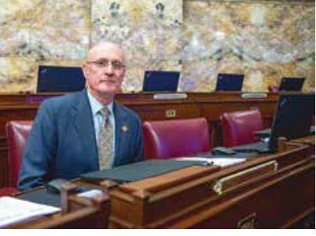
Working for you from the State Capitol this summer!