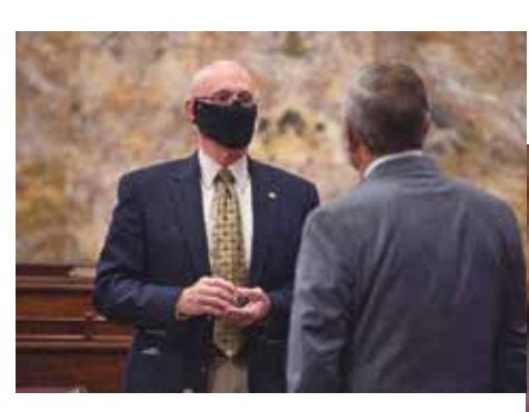
Chatting up a colleague on the House floor.