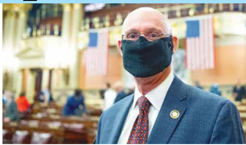
Wear your mask and do your part to help mitigate the spread of COVID-19!

To do so, we must be united and unwavering in our response. Pathogens like the novel coronavirus are indiscriminate in whom they affect. Consequently, it is our collective responsibility