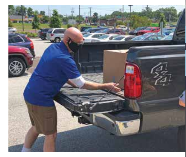
Helping to assemble and distribute meals to families with children in need during our "Community Cares" day this summer!