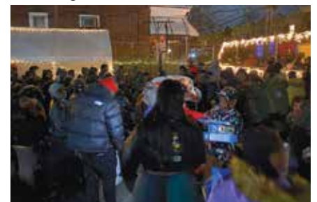
We had a great turnout, I loved meeting everyone who came out.