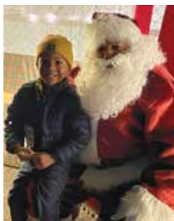
I was in the holiday spirit waiting for our Winter Wonderland event! Santa even stopped by for photos.