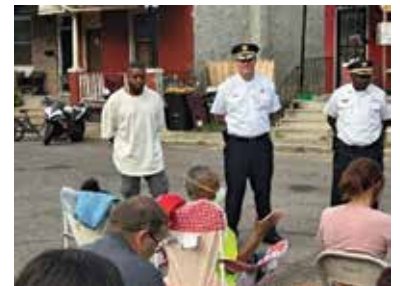
I work with local law enforcement to host community meetings after tragic acts of gun violence shake our neighbors.