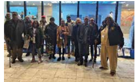
Gathering with our valued community leaders.