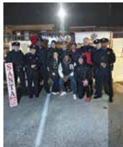
Thanks to the 18th Police District for everything!