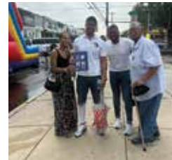
Working hard to help constituents with state government issues.