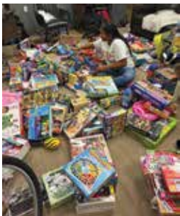
Presents for families at my Winter Wonderland Community Resource Fair.