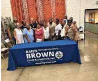
We always work to connect our community with opportunity. We had a successful day at my Job Fair; over 350 people came to talk to employers! Thanks to Mount Caramel Baptist Church for hosting us.