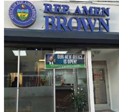
Earlier this year, we opened up our new office space at 4027 Market St. Make sure you stop by to say Hi and see how we can help you!