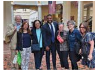
I had a great time when community members from Logan Square came to see me work at the Capitol!