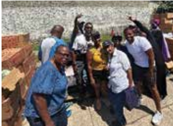
We work with food banks throughout the year to ensure families have access to healthy food.