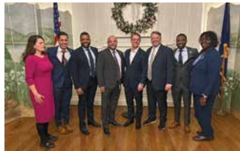
It was great to celebrate the holidays with the Philly Delegation and Gov. Josh Shapiro.