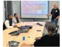
The Philly Delegation learned so much with the Delaware Valley Intelligence Center, which helps analyze crime trends to keep us safe.