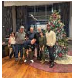
Holiday party in Logan Square.