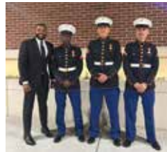
Thankful for our servicemembers fighting to keep us free!