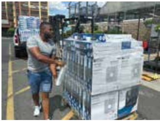
Working hard to cool folks off during the summer heat wave.