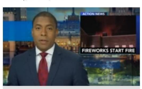
Fireworks blamed for Allentown school fire. Watch the report from Action News Mornings on June 29, 2019.