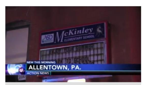
Fireworks blamed for Allentown school fire. Watch the report from Action News Mornings on June 29, 2019