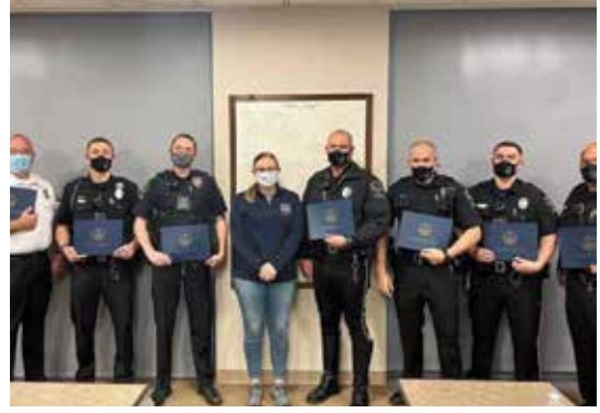
I loved visiting our area's first responders in recognition of National Police Week, May 9 – May 15, and National EMS Week, May 16 – 22. I expressed my gratitude to our community's heroes by delivering lunches from local small businesses and thanking them for all that they do!