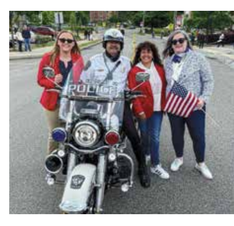
I joined Radnor Township in recognizing Memorial Day this year. I was so proud to see so many people come together to recognize the true reason for this holiday.