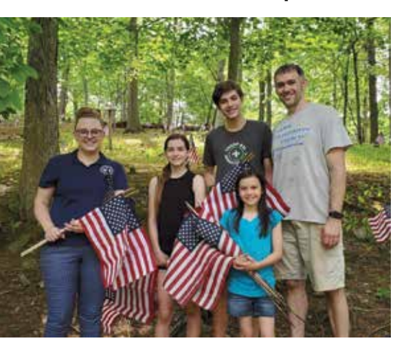
Thank you to those who participated in my flag laying and clean up event at Hayti Cemetery in honor of Forgotten Cemetery Day!

I missed seeing everyone last year! I'm happy to be able to once again safely connect in-person with the people of the 165th Legislative District.