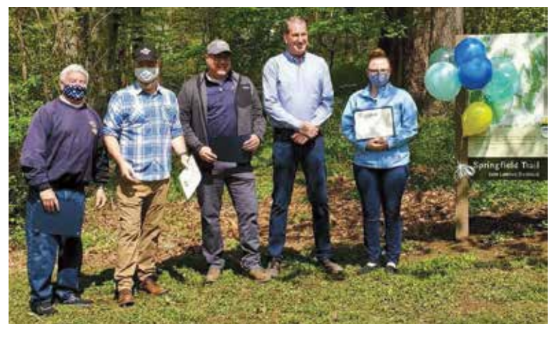
I was delighted to attend the trailhead sign dedication for the brand-new signs installed along the Springfield Trail! These signs were made possible by a state grant that was awarded to our beloved trail after a combined bipartisan effort between me, the Friends of Smedley Park, the Parks Board, and the Springfield Township Board of Commissioners.