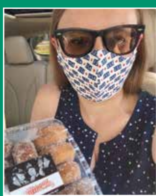
Throughout the pandemic, I've been checking in with small businesses throughout our community so I can bring their needs to Harrisburg and show them my support.