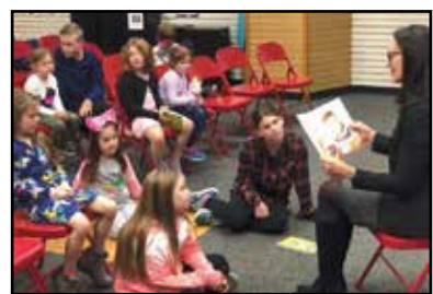
Proud to participate in the Keystone State Literacy Association of Northeastern Pennsylvania's event to encourage children to read. They had the pleasure of hearing me read to them, "Dragons Love Tacos."