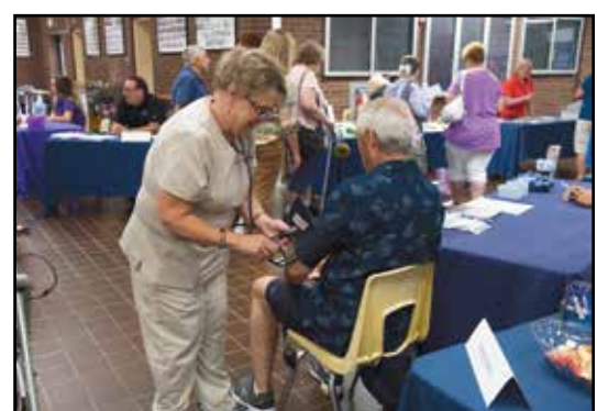
This fall, I had such a great time making breakfast at the Dickson City Civic Center for seniors in the 144th District and discussing how our office can better assist them.