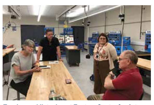
Touring and listening at Eastern Center for Arts and Technology in Upper Moreland Township. What great career and technical education programs available for area students!