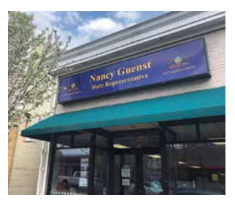
Visit my office at 19 S. York Road, Hatboro.