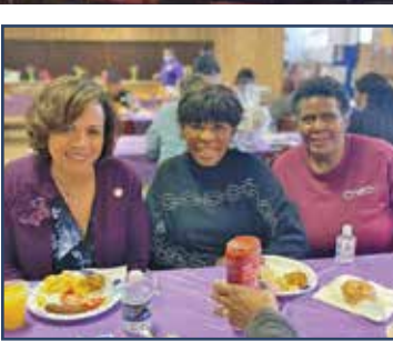
Senior Sunrise Breakfast at St. Paul Evangelical Lutheran Church in Lansdowne.