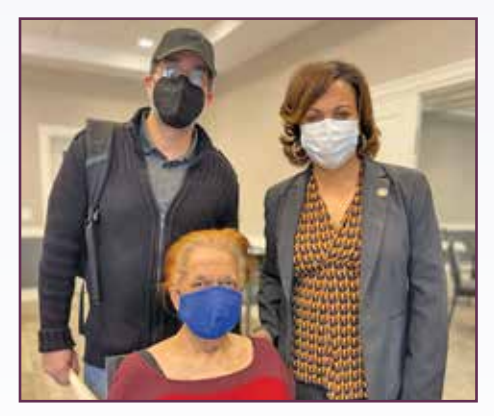
In March, I held a Property Tax and Rent Rebate Program Event at Simpson Gardens. My staff and I met constituents and assisted with rebate applications and other governmentrelated programs. We hope to hold a similar event in the future.

If you need help with the Property Tax and Rent Rebate paperwork, contact my district office at (610) 259-7016 .