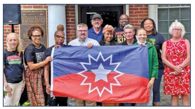
Juneteenth flag-raising ceremony and community celebration in Lansdowne.