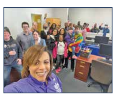
Our first open house in April! It was a pleasure to get to meet you and discuss the services our office offers!