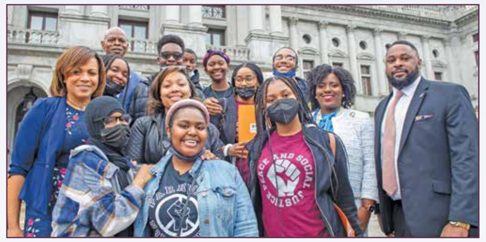
In April, I joined colleagues and students of the Peace and Social Justice Group from Parkway High School in Philadelphia on the steps of the Capitol.

There have been more mass shootings than days so far in 2022. I am angry with the lack of action we see in Harrisburg. As a member of the PA Safe Caucus, I'm working to secure funding from the Pennsylvania Commission on Crime and Delinquency to help our communities pay for safety and security initiatives, and I strongly support a ban on assault weapons, universal background checks, and introducing cooling off periods. Our attempts to move gun safety measures to the full House for a real debate continue to be blocked.