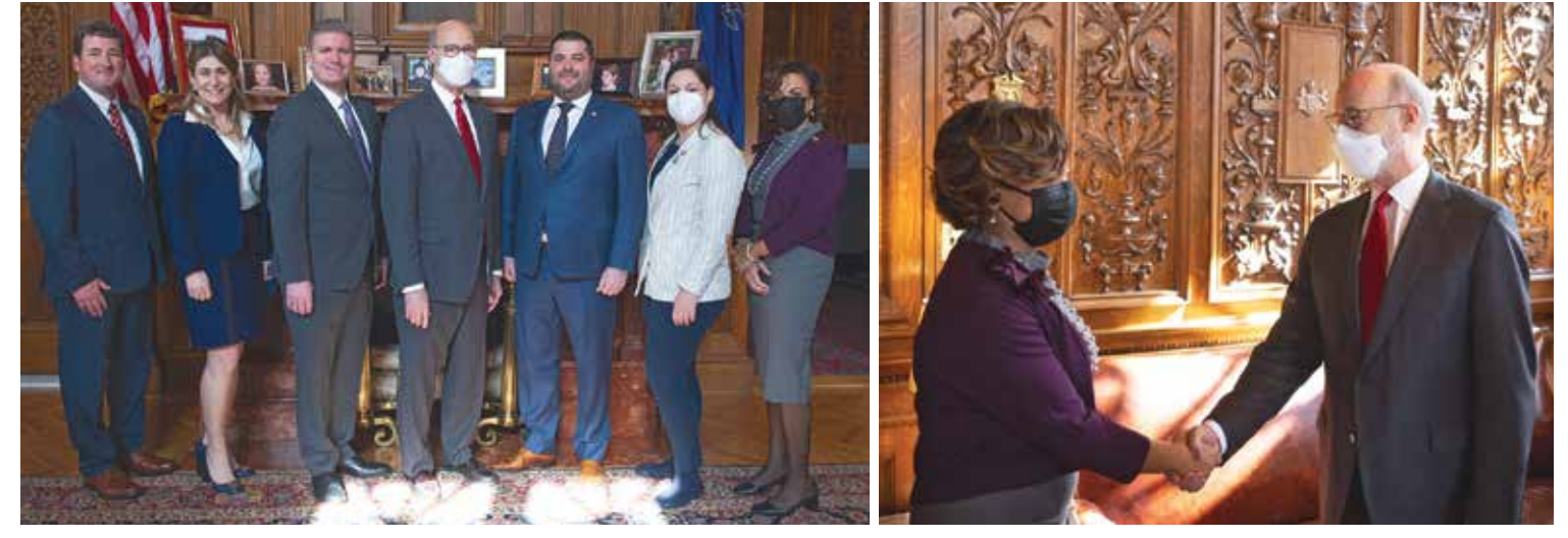
I served on the Escort Committee during Gov. Tom Wolf's final budget address.