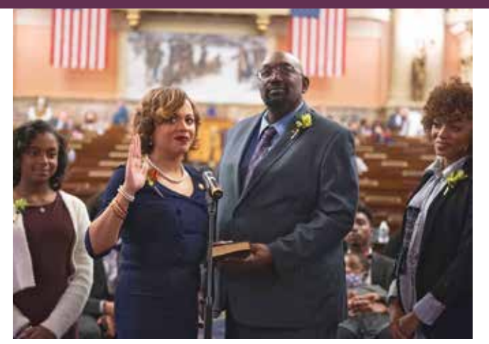
On December 13, I took the oath of office, alongside my family, to serve as your state representative.