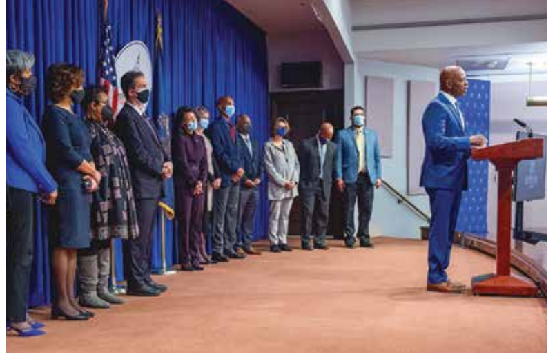
I joined my colleagues at a news conference to discuss prison reform.