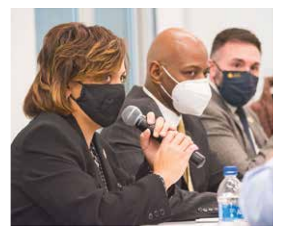
Increasing Participation in Academia Policy Hearing held at State College.