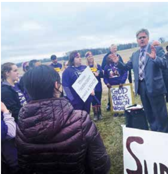
I was proud to join a rally on behalf of the incredibly hardworking and dedicated nurses and caregivers at the Meadows!