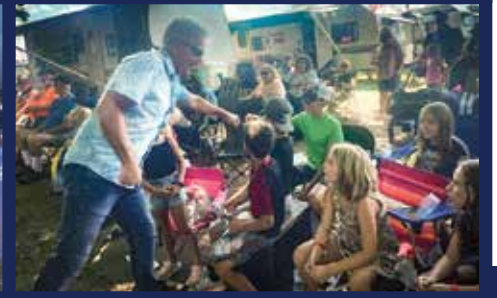
Last year's Grange Fair was a huge hit, and I am looking forward to seeing everyone at this year's event! Earlier this year in Harrisburg, we recognized the 150th anniversary of the Pennsylvania State Grange. To honor this monumental occasion, I sponsored House Resolution 148, which passed the House with overwhelming bipartisan support. The resolution officially recognizes September 18, 2023 as State Grange Day here in Pennsylvania.