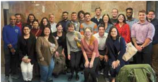
It's always inspiring talking with Penn State Law students, who are some of the most intelligent and driven individuals I've met.