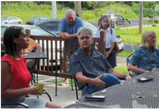
I was honored to join community members and local leaders at an engaging and productive Coffee and Conversations event in Ferguson Township!