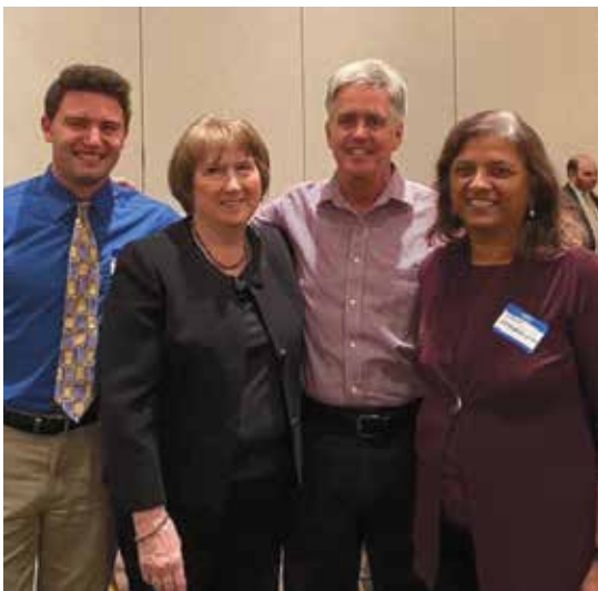
It was great to see new local government and community leaders at an event in State College!