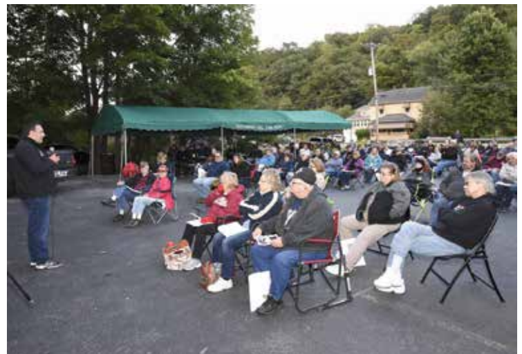
Lower Yoder Township