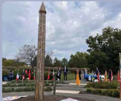
Speaking at the Rotary Club of Monroeville's International Day of Peace celebration in Monroeville Park.