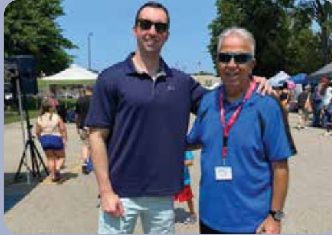
Monroeville Public Library's annual Summer Fun Fest.