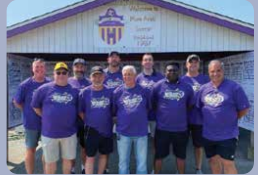
27th annual Plum Soccer Kick-off Classic tournament.