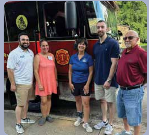
At Pitcairn Hose Company #1's Fireman's Festival and Parade.