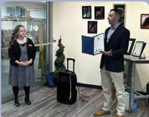
Presenting the Monroeville Public Library with an official certification of recognition on its 60th anniversary.