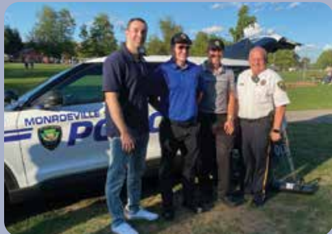
National Night Out festivities with Monroeville and Pitcairn Police Departments.