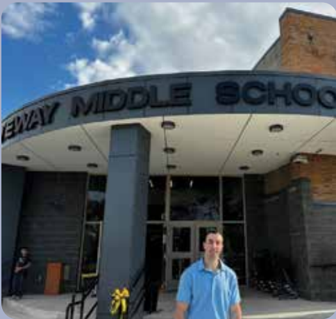
At the opening of the Gateway Middle School.