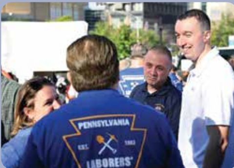
Supporting our unions at Pittsburgh's Labor Day parade.