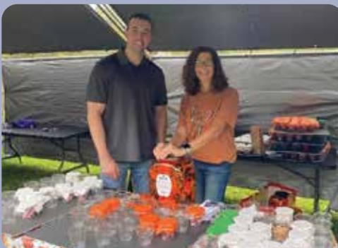
Plum Fall Fest.