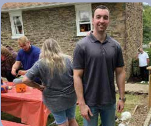
Heritage Days in Monroeville.