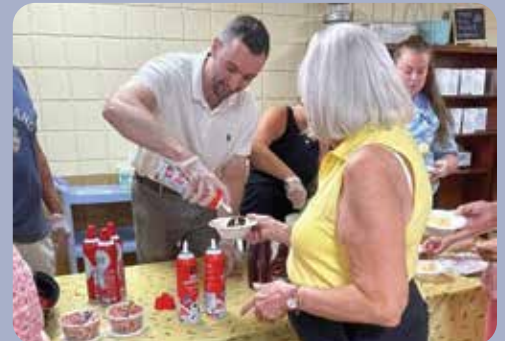
My office sponsored a meet-and-greet ice cream social at the Monroeville Senior Citizen Center.