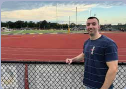
Under the Friday night lights for the Gateway at Plum game.