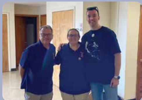
United Volunteer Fire/Rescue and Eastern Area Prehospital Services held a picnic with first responders in East McKeesport.