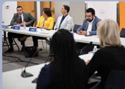
I joined the PA House Transportation Committee for a hearing on public transit needs in Allegheny County.